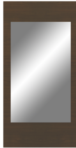
Model: EXMRA 23.25W 0.75D 45H

The contemporary Essex collection features a distinctive leg design providing a dimensional look that allows for easy cleaning. Select tone-on-tone or contrasting wood-grained finishes for legs and top. Customizable and available in a variety of sizes. Sophisticated hardware delivers added style.